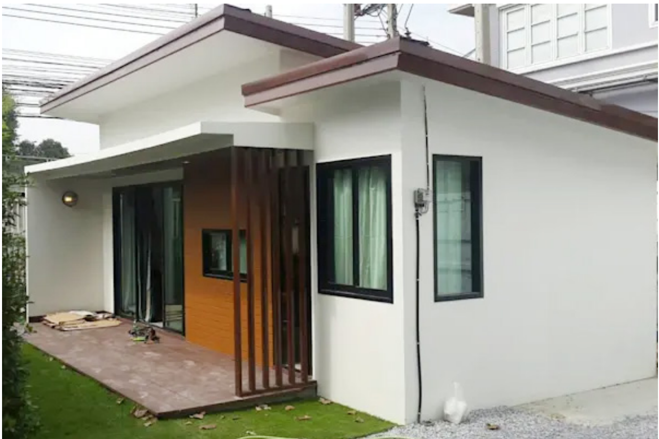
Prepare the frame

The project was built in Thailand at a cost of 380,000 Baht equivalent to 263 million VND.